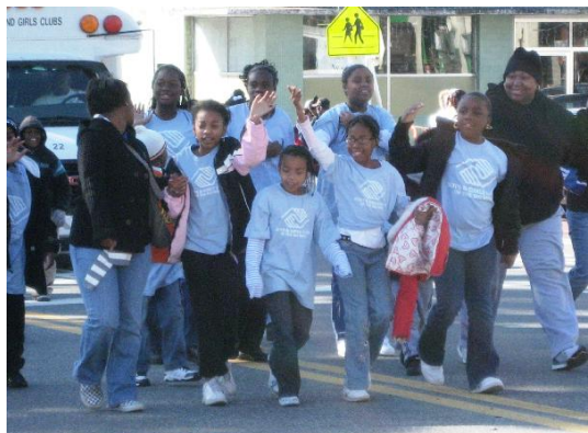
Boys & Girls Clubs of the Big Bend members march in honor of Dr. King

To pay tribute to the late Dr. Martin Luther King, Jr., more than 200 Boys & Girls Clubs members ages 5 to 18 marched in the Martin Luther King Day parade Jan. 21 in downtown Monticello. Their participation in the event symbolizes the start of "40 Days of Nonviolence: Building the Beloved Community," a national campaign of service and education projects aimed at promoting Dr. King's message of nonviolence and social justice as the 40th anniversary of his assassination approaches.