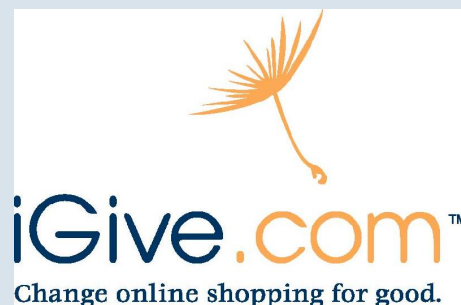
Photo: Click on the logo for more information on iGive.com.

Click on the logo to be directed to the iGive site. Follow the directions on the site to find and select the Boys & Girls Clubs of the Big Bend. Then register with iGive so that when you shop online, a percentage of your proceeds will go to benefit thousands of our children. It's a fun and easy way to give back to your local community.